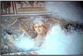
Mona Lisa of Galilee: Mosaic from banquet hall of 3 rd century Roman mansion in Sepphoris.