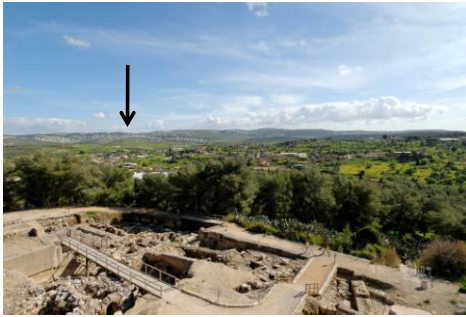
Nazareth view south from Sepphoris.

Matt. 5:14: "A city situated upon a mountain cannot be hid."