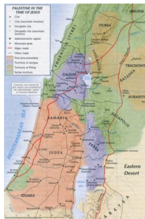
Holman Illustrated Bible Dictionary, 851