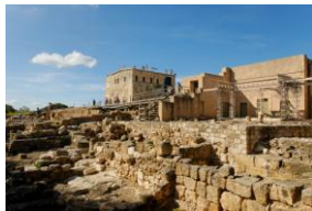
Sepphoris excavations.