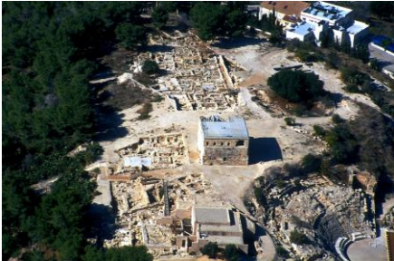
View of remains of Sepphoris from east.