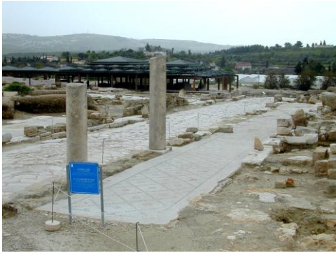
Roman cardo, 1 st Century A.D.