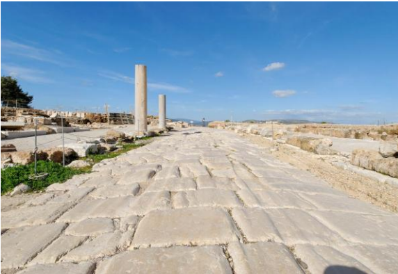
Sepphoris cardo with wheel ruts.