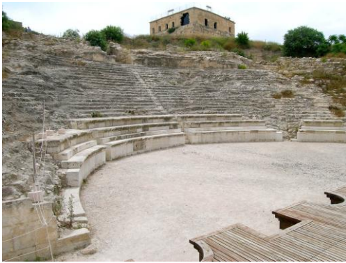
Sepphoris theater, 1 st Century A.D.