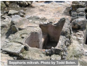
Sepphoris mikvah.